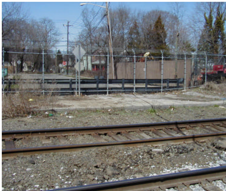
1 st Ave. After proper removal of scrap

Here is a photo depicting the same area after cleanup