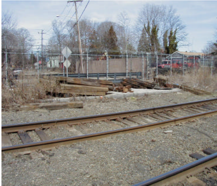
1 st Ave. Montauk Branch

Here is a typical pile of scrap material left on the ROW, including ties and tie plates.